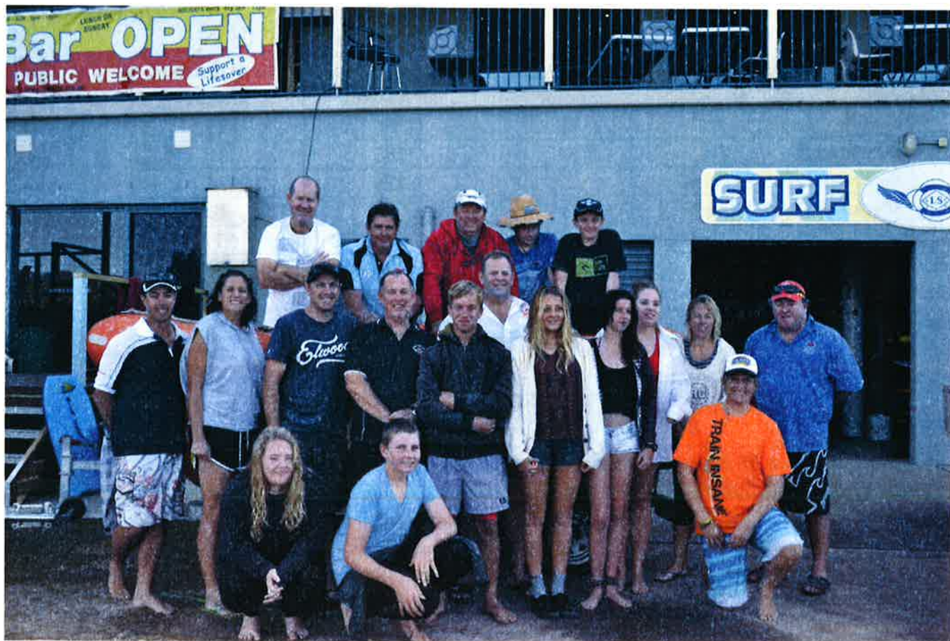
A very successful IRB Driver & Crew course was held at SWR