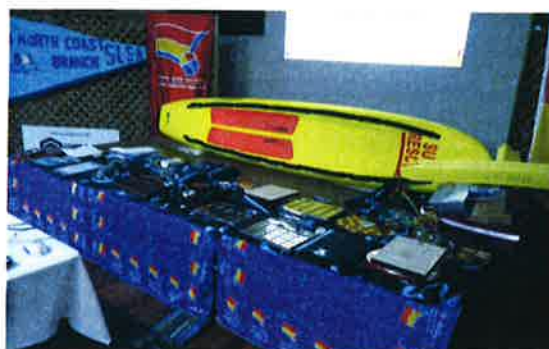
Prizes and Trophies