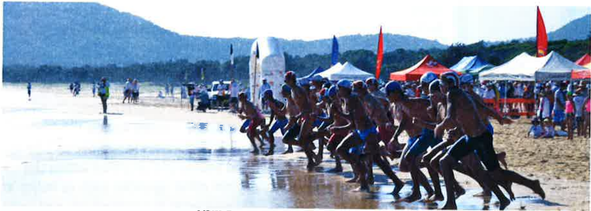
NSW Country Championships SWR 2013

Competition at both senior and junior events was well patronised and our Interbranch Team performed admirably. The North Coast Boat Series have held regular Carnivals within the Branch and they have been able to maintain a successful series. Our Clubs competed at Country, State and Australian Championships with some very pleasing results. South West Rocks SLSC must be congratulated for their hosting of the NSW Country Championships for the past four years and deserve a well-earned rest.