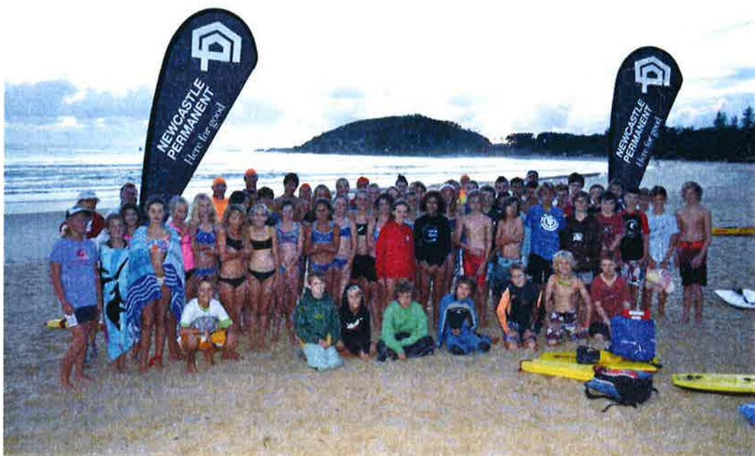
Junior Leadership Camp 2013