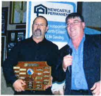
Hat Head 1 st