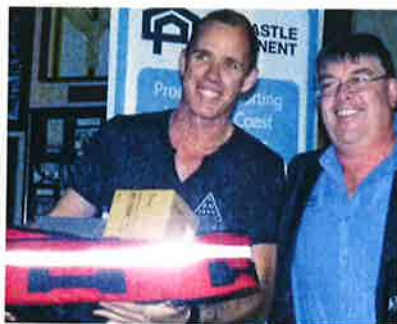
Tacking Point 2nd