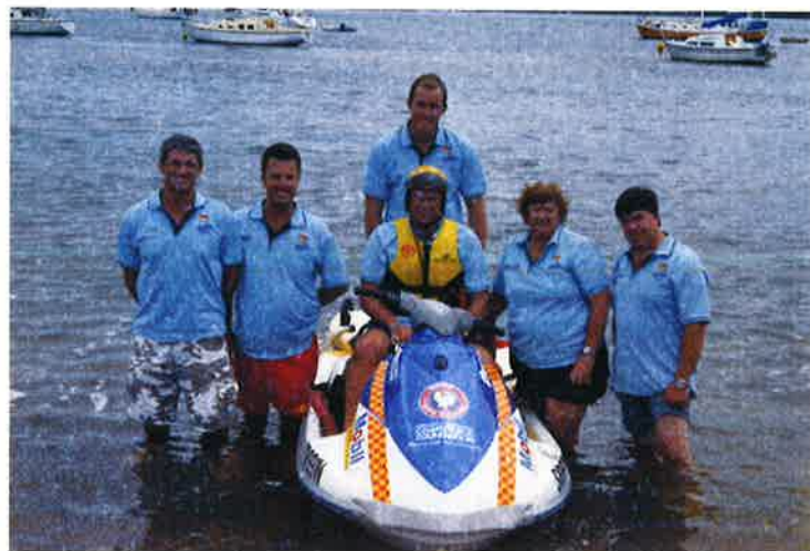
MNC Support Operations