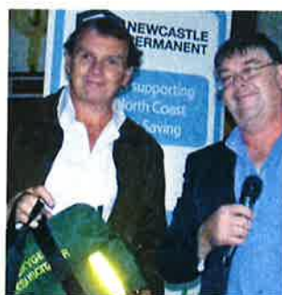
Macksville Scotts Head 3 rd