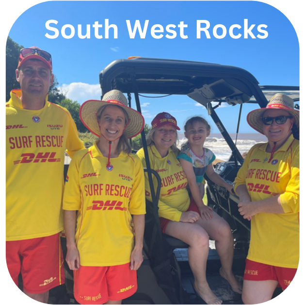
South West Rocks