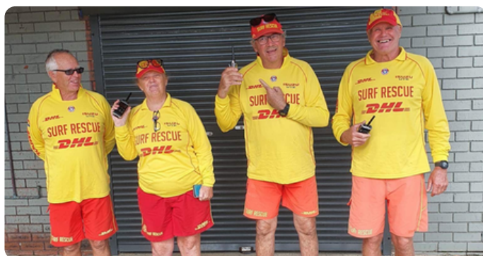
MSHSLSC - Patrol 7