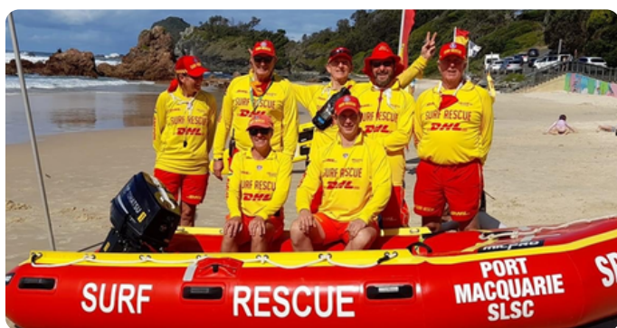
PMSLSC - Patrol 4 and Patrol 1