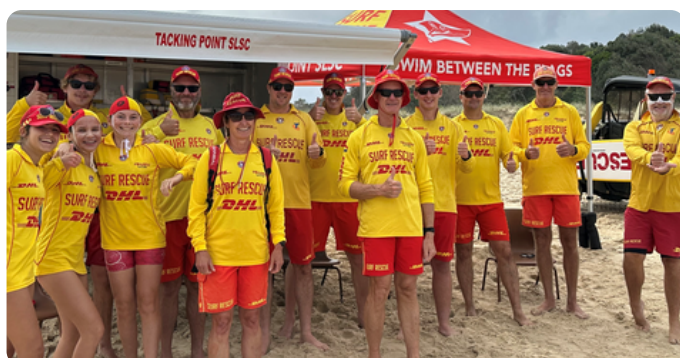
TPSLSC - Manta Rays + Sharks