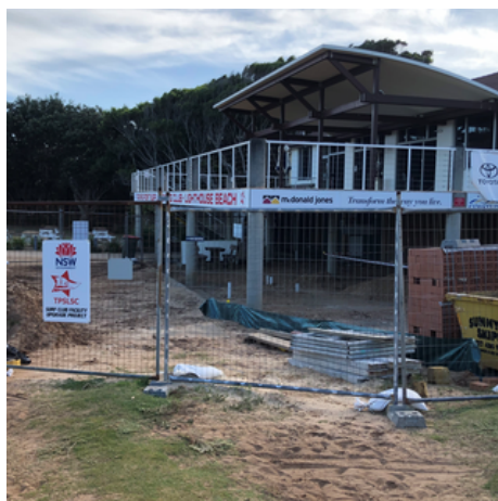
Start of the works....

TPSLSC has been undergoing major renovations to the downstairs area of the club. If all continues to go to plan they will have a brand new facility ready for the new season!