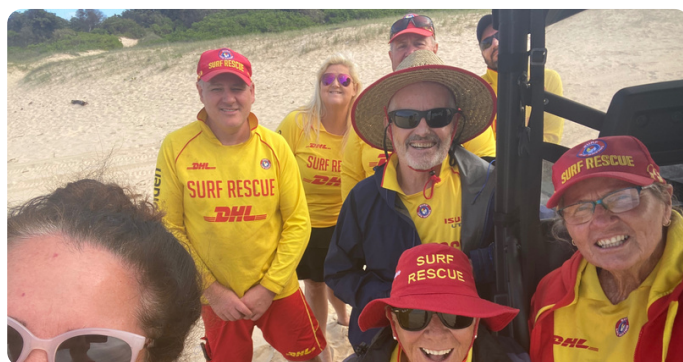
SWRSLSC - Patrol 5