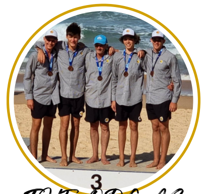
THE 3 ORCAS