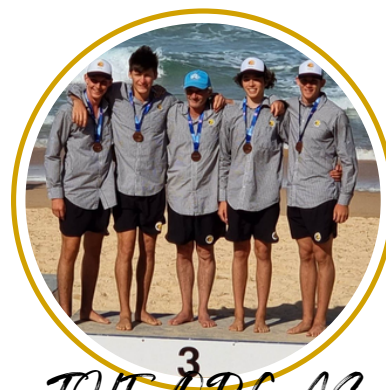
THE 3 ORCAS